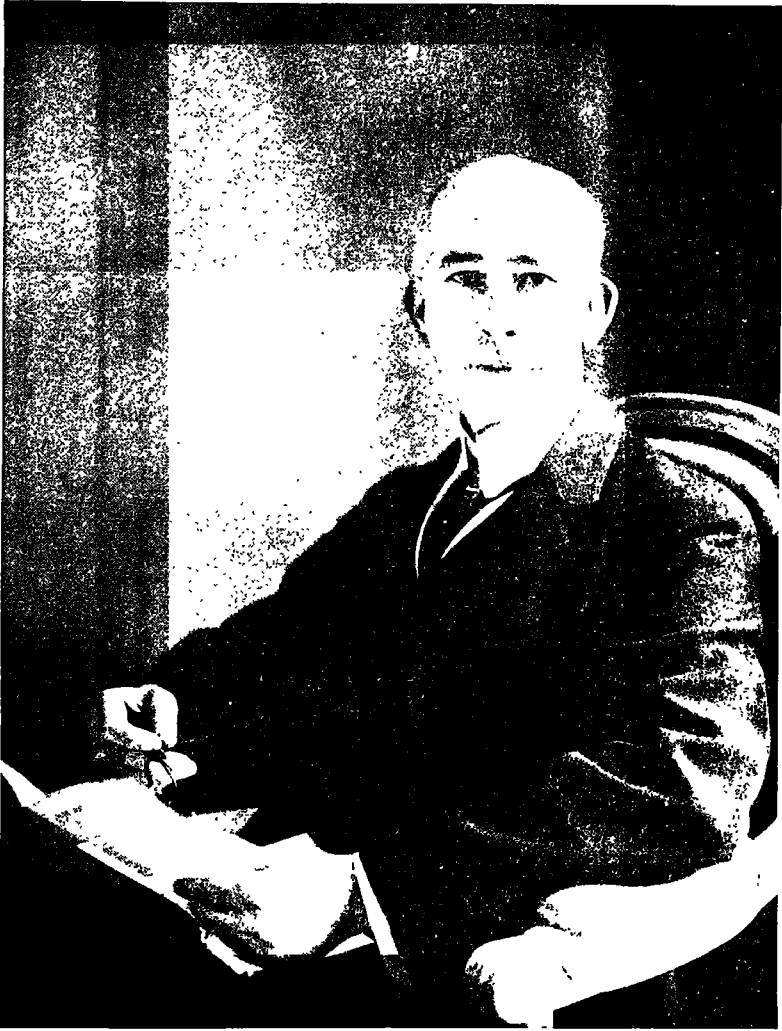
COLONEL EDWARD M. HOUSE